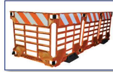
Fence with flat weights