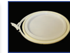
Plastic lever-lock lid