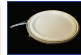
Metal lever-lock lid