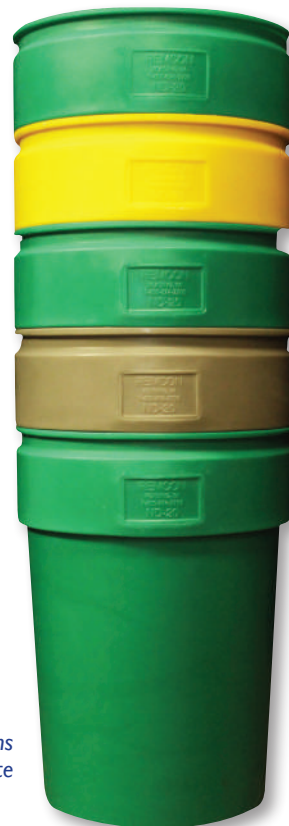
Nestable drums save space