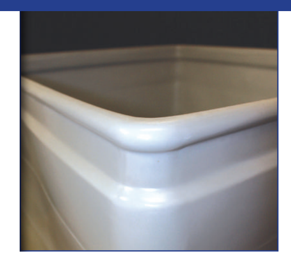
Exclusive "R" Lip