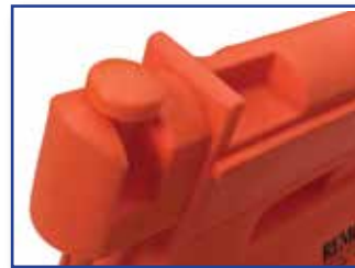
Molded-in pocket for standard blinking light / pin coupler