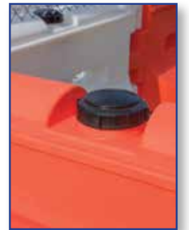
Threaded fill cap