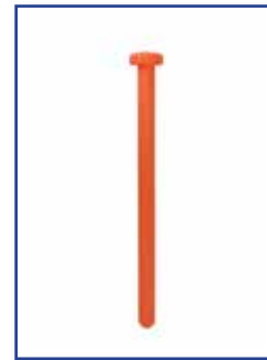
GUARDSAFE 36 interlocking pin